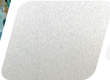
JT 9700 Frosted